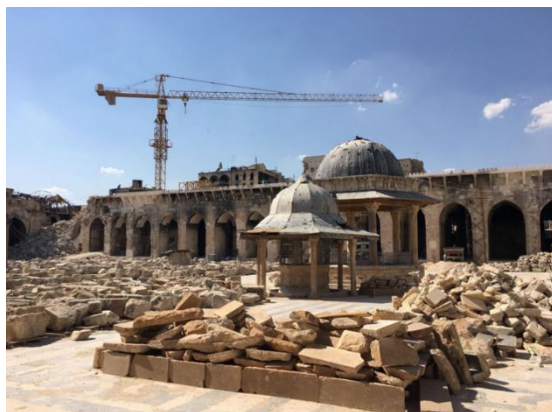
The Umayyad Mosque in Aleppo