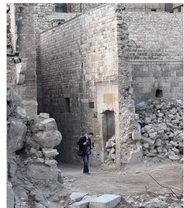
Al-Kikhia neighborhood, old Aleppo