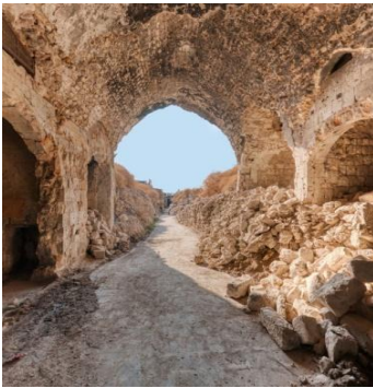
Abaya market, old Aleppo