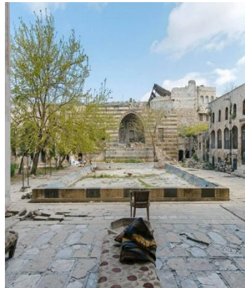
Bait Junblatt Palace, old Aleppo