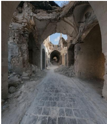
Al-Suwaiqah, Old Aleppo