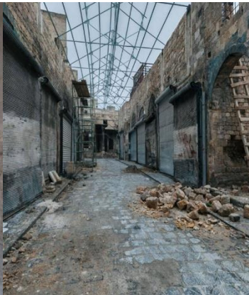
Al-Khabieh Market, Old