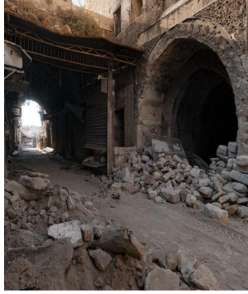
Khan al-Sabun, Old Aleppo