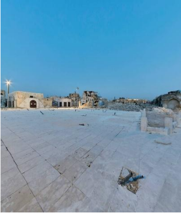
Al-Hatab Square, Old Aleppo