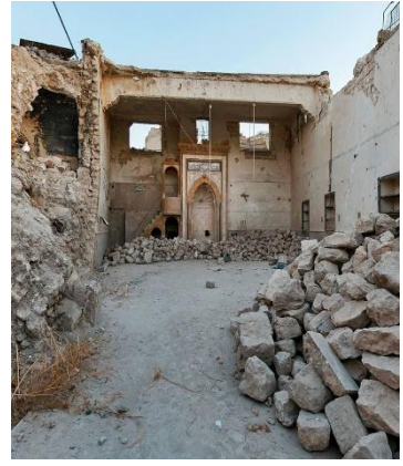
(Perfumers market) Mosque, Old Aleppo