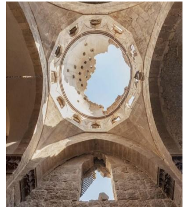
Bait al-Wakeel Mosque, Old Aleppo