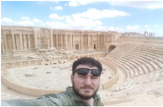
A Russian mercenary in Palmyra