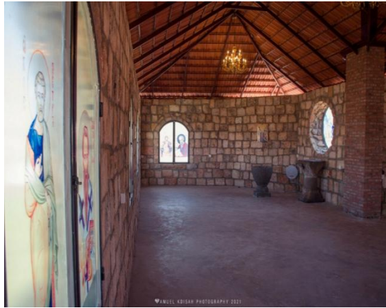
Antiquities stolen from archaeological sites and transferred to the Church of the Forty Martyrs in Mahrada, which was built in 2021