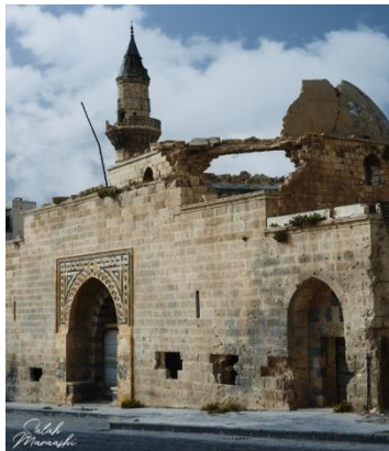
Matbakh Al-Ajami Aleppo