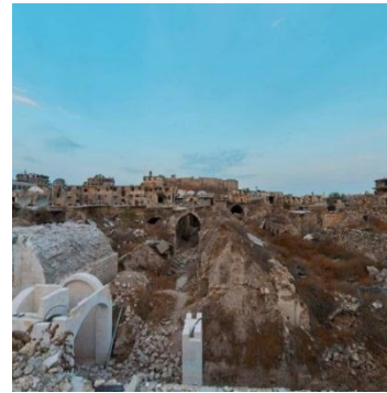
Al-Sarmatieh market, Aleppo