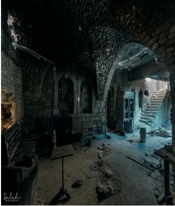
Al- Farafra, Old Aleppo