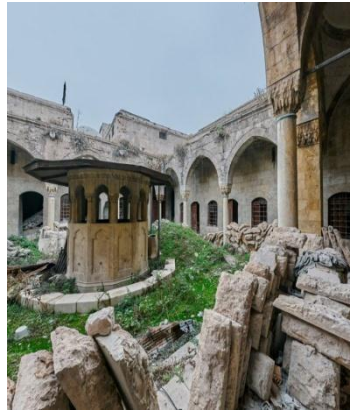
The Ahmadiyya School, Old Aleppo