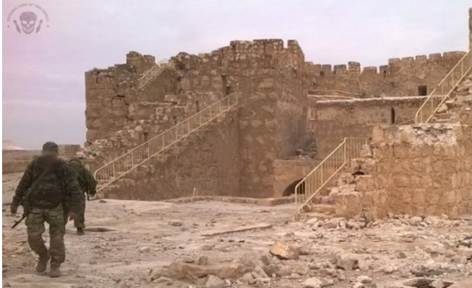
Wagner mercenaries in Palmyra and the destruction due to the bombing and missile targeting