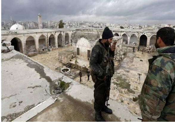
The shabiha of the Fifth Corps in Ma'arat al-Numan Museum