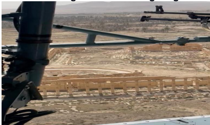
Russian planes over the ruins of Palmyra