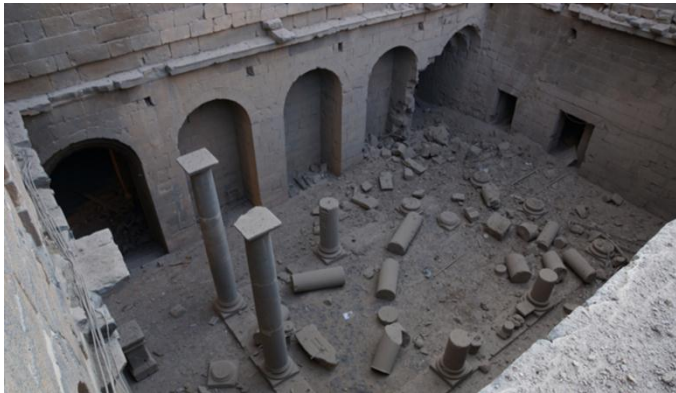
Destruction in Bosra al-Sham